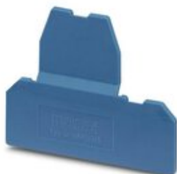
End cover, length: 67 mm, width: 2.5 mm, height: 62 mm, color: blue

Please be informed that the data shown in this PDF Document is generated from our Online Catalog. Please find the complete data in the user's documentation. Our General Terms of Use for Downloads are valid ( http://phoenixcontact.com/download )